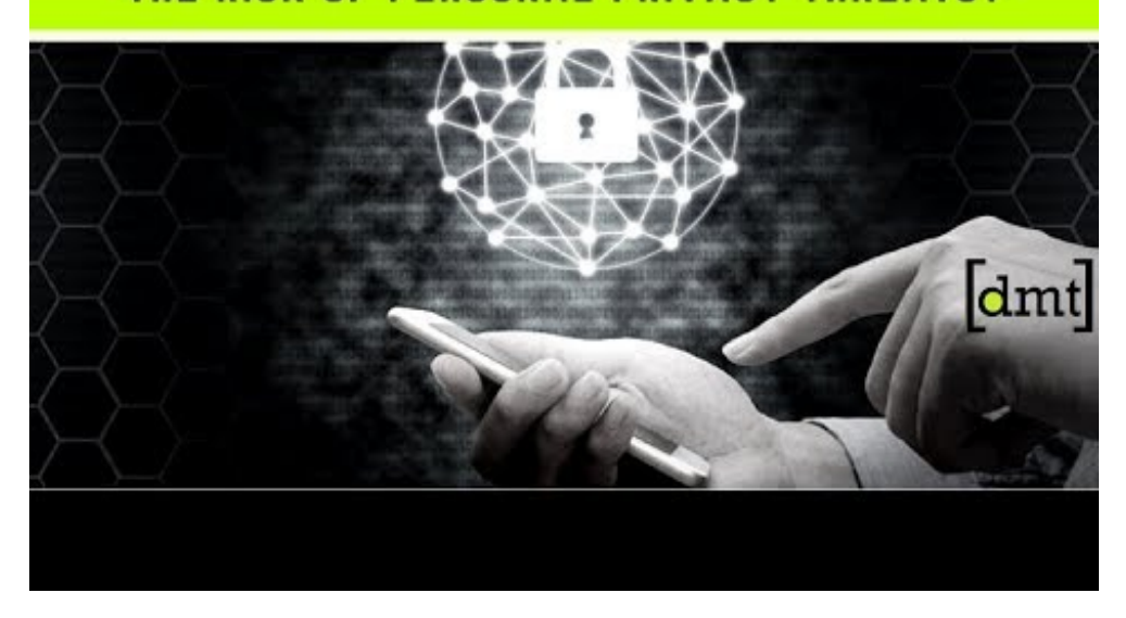
Watch Video At: https://youtu.be/V6klJMZpnWs