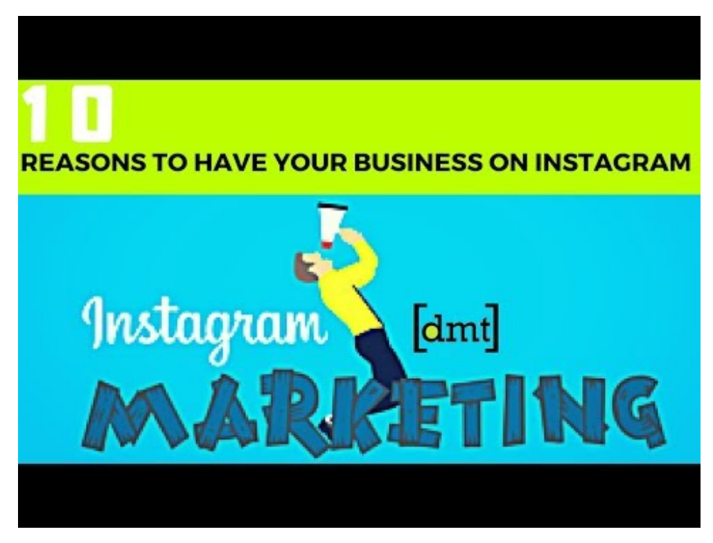
Watch Video At: https://youtu.be/lk_C4ZeiuXk

These tools help users achieve their goals, while making sure that not a single minute goes to waste. Some tools are free, while some require monetary investment, but that's fine. We assure you, these tools are worth every single penny.